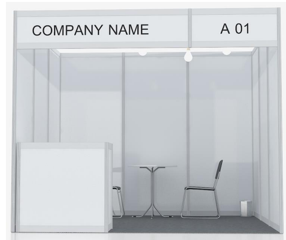
Sample 9 sqm Shell Scheme Stand